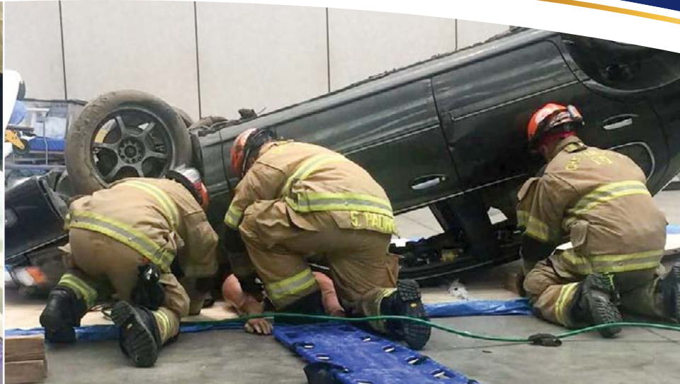
Top left: Participants work together to tackle the Trauma Challenge station.; Top right: Chattanooga fire fighters demonstrate patient extrication from roll-over MVA entrapment.