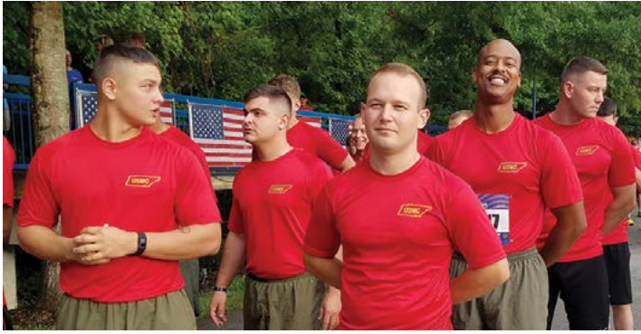
Marines waiting for the start of the 2nd Annual Chattanooga Heroes Run.