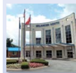
Located at 632 Morrison Springs Road at the foot of Signal Mountain, Tenn., the Erlanger North Campus offers a variety of services and programs.