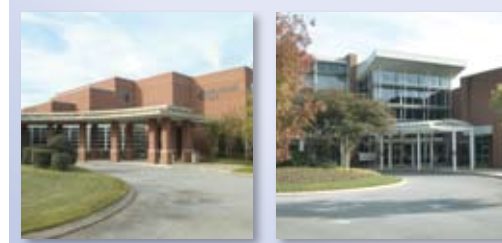
Located at 1755 Gunbarrel Road near Hamilton Place in Chattanooga, the Erlanger East Campus offers maternity, surgical and walk-in urgent care services, as well as physician offices.